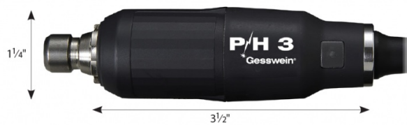
M08X, M15X, M30X Weight: 6.2 oz.