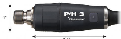
M55X Weight: 3.2 oz.