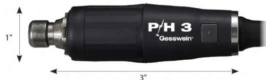
M20X, M35X Weight: 4.25 oz.